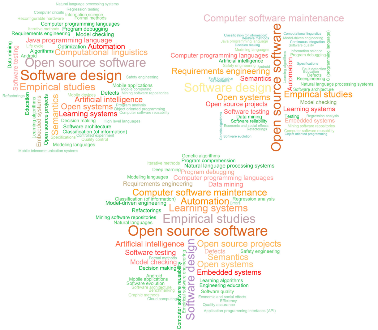
Fig. 1. Most repeated keywords in (a) 2016, (b) 2017, and (c) 2018.